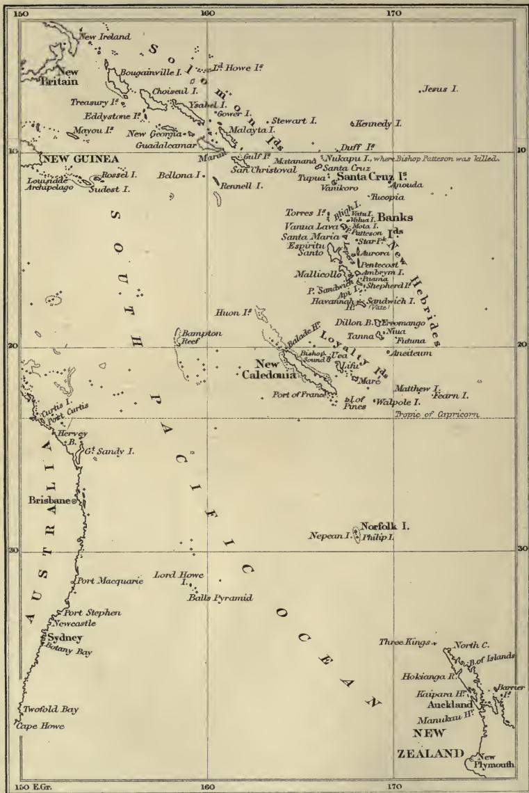
Stanford's Geog. Estab. London.